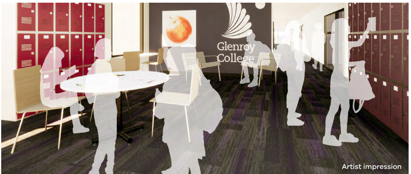
Indoor locker areas located next to home rooms in the junior learning centre

The welcoming and nurturing junior learning centre is designed to help Years 7-9 students transition smoothly and thrive in their secondary school journey with the support they need.