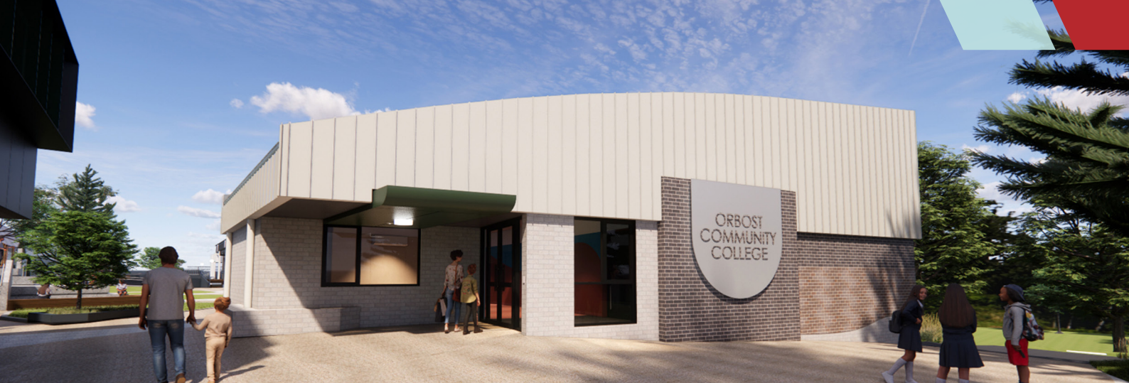
Orbost Community College - west entry Artist impression only, subject to change