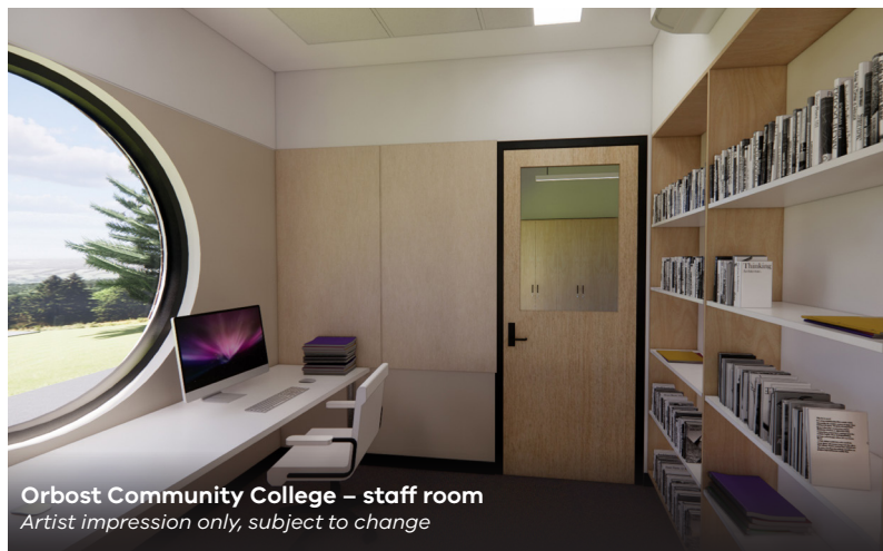
Orbost Community College – staff room Artist impression only, subject to change

There will be closer connections between students and staff, and better transition and wellbeing support as students move from primary to secondary learning.