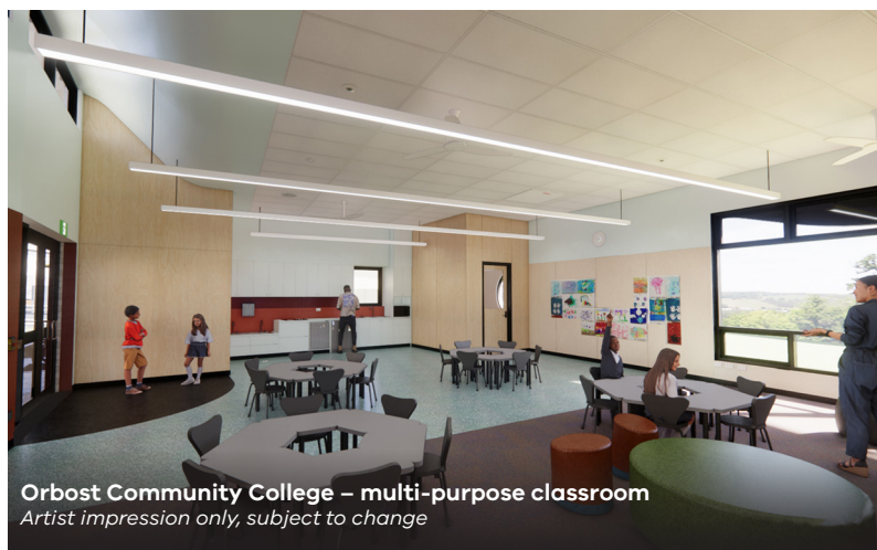
Orbost Community College – multi-purpose classroom Artist impression only, subject to change