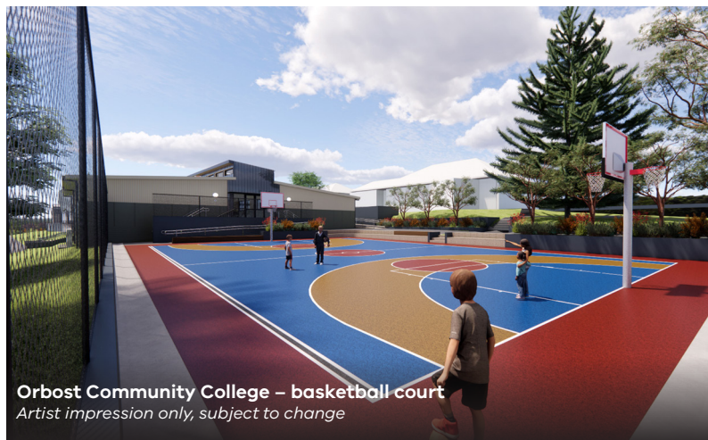
Orbost Community College – basketball court Artist impression only, subject to change